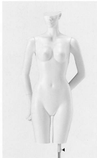
ELE 5 本体高さ 103.0 B81.0 W58.0 H89.0 右腕 ELE 5 / 右手先 PW D 左腕 ELE 5 / 左手先 PW A