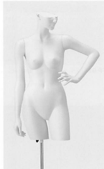
ELE 7V 本体高さ 92.5 B81.0 W60.5 H89.5 右腕 ELE 7 / 右手先 PW 16 左腕 ELE 7 / 左手先 PW E