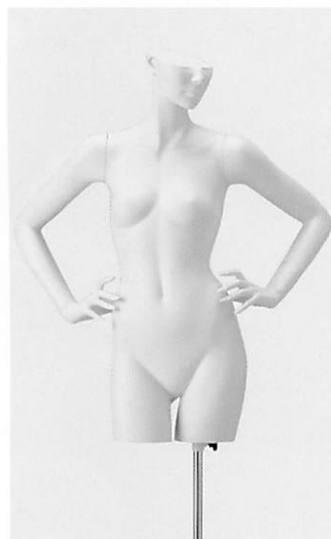
ELE 9V 本体高さ 91.0 B76.0 W57.5 H83.0 右腕 ELE 9 / 右手先 PW A 左腕 ELE 9 / 左手先 PW E