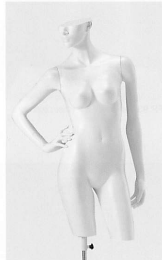
ELE 6 本体高さ 103.0 B84.0 W61.0 H99.0 右腕 ELE 6 / 右手先 PW A 左腕 ELE 6 / 左手先 PW A