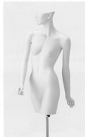
ELE 10V 本体高さ 92.5 B77.0 W56.0 H83.0 右腕 ELE 10 / 右手先 PW H 左腕 ELE 10 / 左手先 PW C