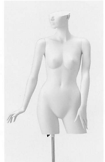
ELE 8V 本体高さ 94.0 B79.0 W58.5 H90.0 右腕 ELE 8 / 右手先 PW C 左腕 ELE 8 / 左手先 PW F