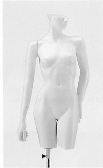
ELE 2 本体高さ 92.0 B82.0 W58.0 H86.0 右腕 ELE 2 / 右手先 PW G 左腕 ELE 2 / 左手先 PW B