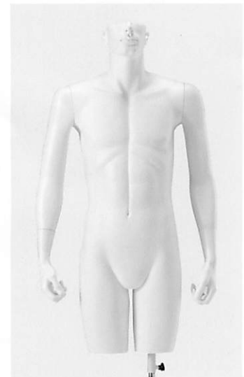
ELE 12 本体高さ 108.0 B92.5 W82.0 H92.5 右腕 ELE 12 / 右手先 PM M 左腕 ELE 12 / 左手先 PM K