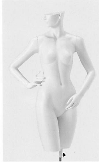
ELE 3 本体高さ 106.0 B81.0 W58.0 H90.0 右腕 ELE 3 / 右手先 PW A 左腕 ELE 3 / 左手先 PW A