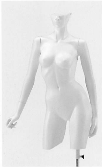
ELE 1 本体高さ 94.0 B82.0 W58.0 H86.0 右腕 ELE 1 / 右手先 PW H 左腕 ELE 1 / 左手先 PW A